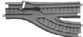
E Switch Trach (Right) x 1